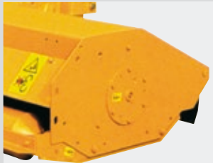
Pto shaft with overrun clutch ■