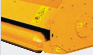
Inner lining ■